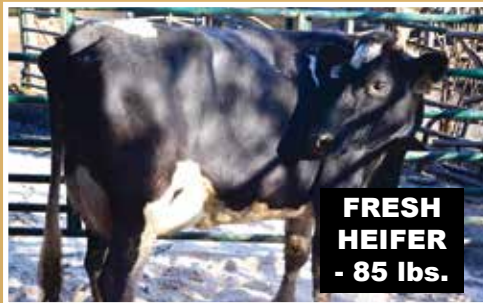
FRESH HEIFER - 85 lbs.