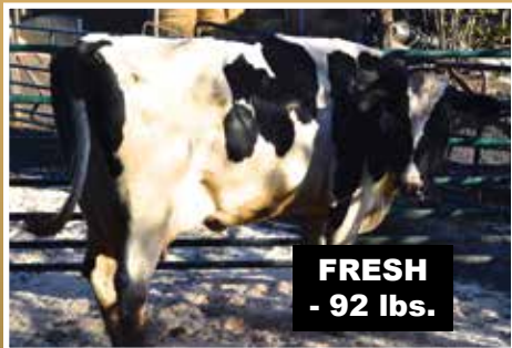
FRESH - 92 lbs.