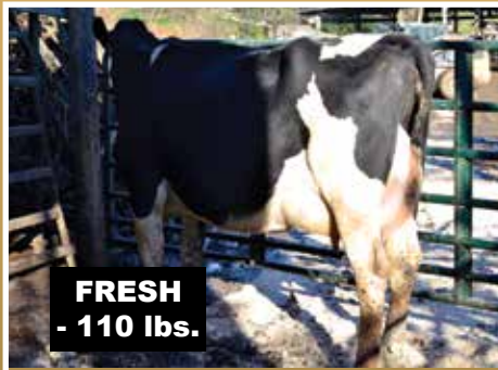
FRESH - 110 lbs.