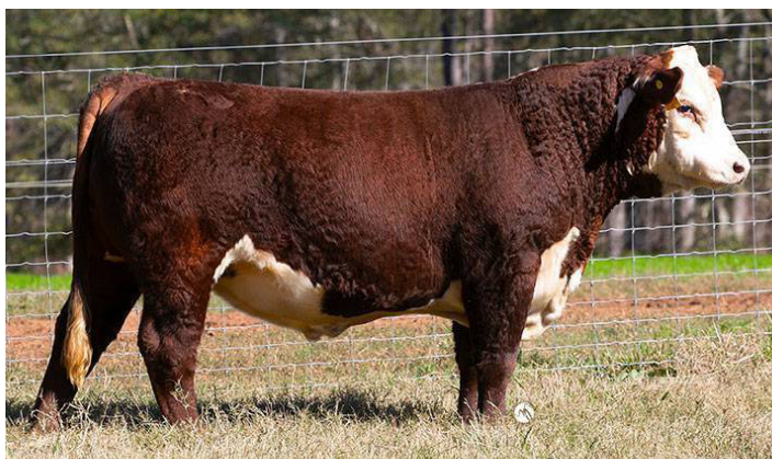
INNISFAIL TRADEMARK 1939 ET — Grandsire of Lots 2-4