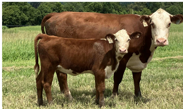
Lot 22 — WPM 16F Lavender L61