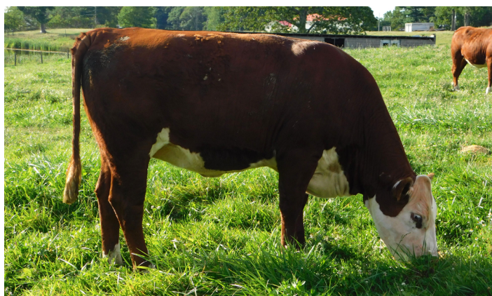
Lot 12 — GHF MS SONOMA 33Z 920 M423