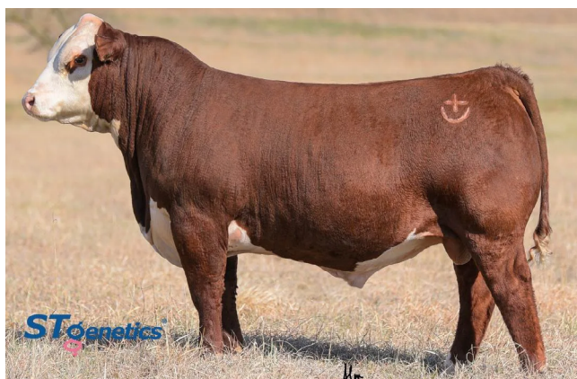
SHF HOUSTON D287 H086 — Sire of Lot 23