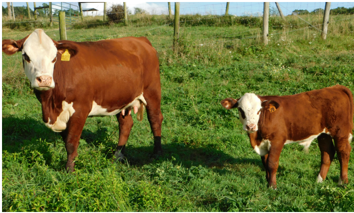
Lot 15 — GHF MS DURANGO D608 606 L343 pictured with bull calf