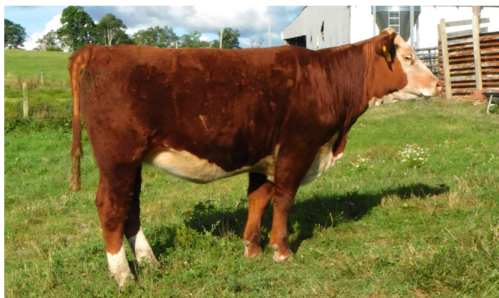
Lot 14 — GHF MS JOGETTE 68E 954 M431