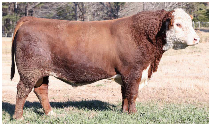
BENNETT EAGLE H550 — Grandsire of PE bull, KCF Bennett H550 K429