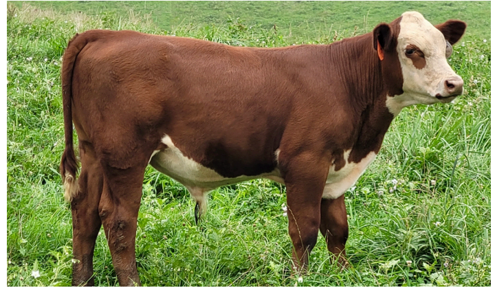
Lot 5A — CB LL MR NIXON 52J 672

Here is your opportunity to take home a set of twin heifers!