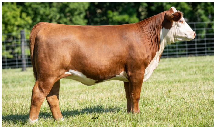
Lot 11 — Boyd Rachel 3160