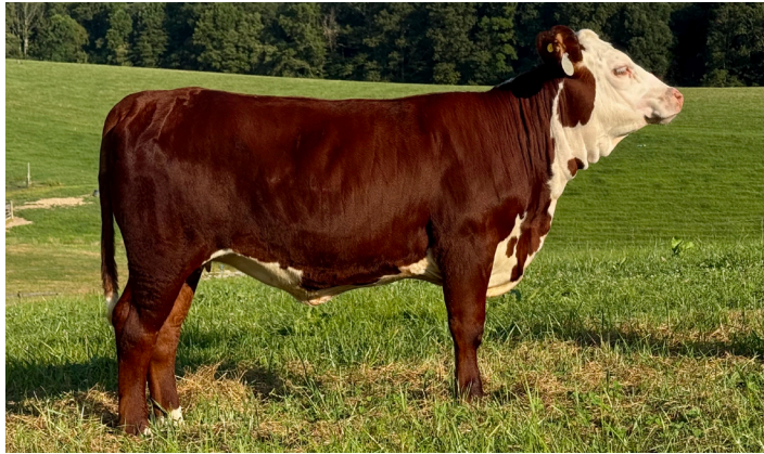
Lot 6 — CB LL MISS MYLEE 662

Here is your opportunity to take home a set of twin heifers!