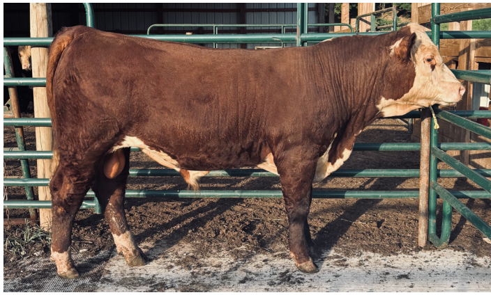
Lot 1 — JW 564G K25 GOLDRUSH M34