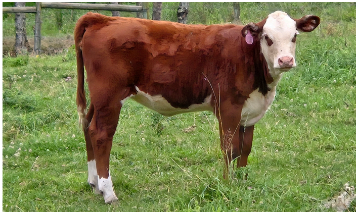
Lot 36 — SDBL VICTORY