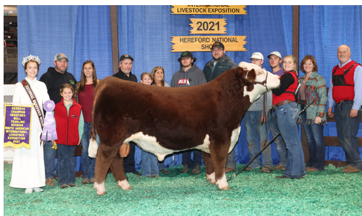
WILDCAT MF EL CHAPO 13 — Sire of Lots 24 & 25