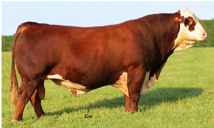
CMF 1720 GOLD RUSH 569G ET — Sire of Lot 1