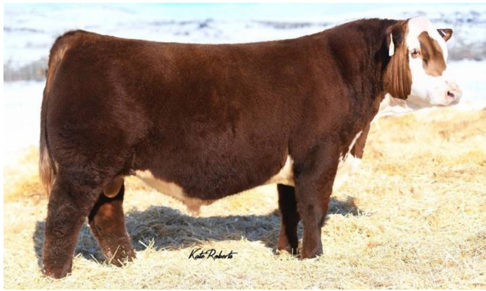
CHURCHILL DESPERADO 029H — Sire of Lot 8