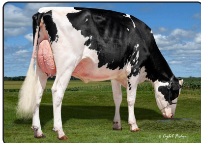
Genosource Cause A Stir-ET VG-86 Dam of Lot 99

Generation Next and Down Home 14214 Christoph Rd, Dyersville, IA 52040 563.451.9952 • alankruse16@gmail.com