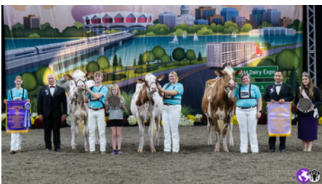
Kress-Hill SHOOK IT-Red-ET

Spicy-Int. & Grand Champ. WI State R&W Jr Show 2024 Shy-HM Grand Champ. WI State R&W Jr Show 2024