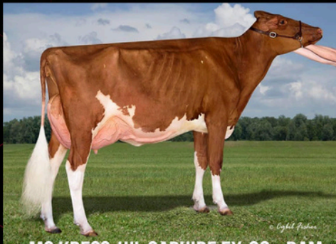
MS KRESS-HIL SAPPHIRE EX-92 - DAM