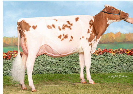
Kress-Hill SPICY-Red-ET Owned by Arizona Dairy Res. All-American R&W Winter Yearling 2022 Res. Jr. All-American Sr. 2 Year Old 2023 Nom. Jr. All-American R&W Sr. 3 Year Old 2024