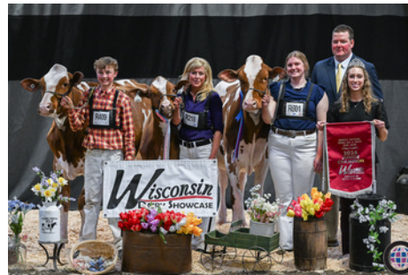
Kress-Hill SHOOK IT-Red-ET

Reserve JC - BC R&W Spring Show 2023 HM JC - BC B&W Spring Show 2023