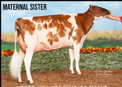
KRESS-HILL SCI-FI VG-89 (MAX)