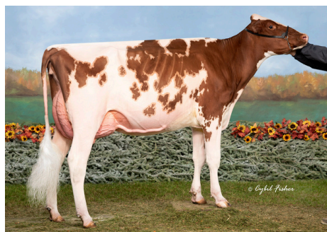
Kress-Hill SMOKE-Red-ET Owned by Arizona Dairy Unanimous Jr. All-American R&W Summer Yrlg. 2021 Res. Jr. All-American Summer Jr. 2 Yr Old 2022