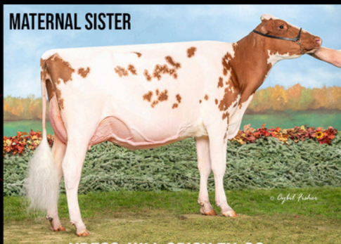
KRESS-HILL SPICY EX-92