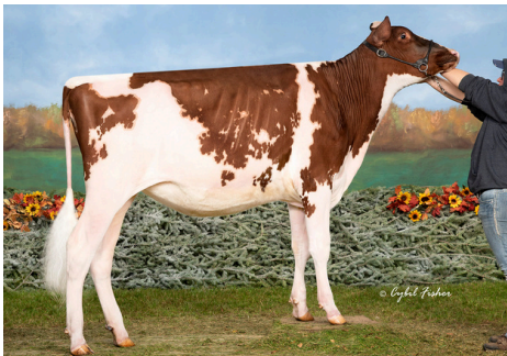
Kress-Hill SLY-Red-ET Res. All-American R&W Summer Yearling 2022