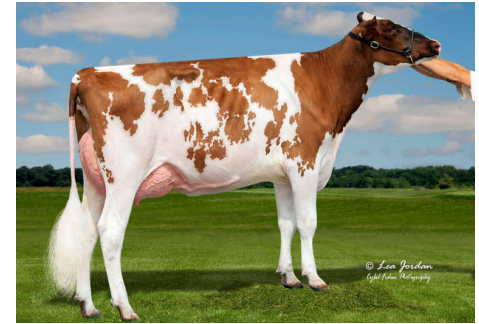
Kress-Hill SCI-FI-Red-ET Junior All-American R&W Spring Yearling 2022 Junior All-American R&W Jr. 2 Year Old 2023 Nom. All-American R&W Jr. 2 Year Old 2023