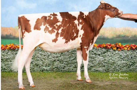
Kress-Hill SMIRK-Red-ET Nom. Jr. All-American R&W Spring Calf 2024