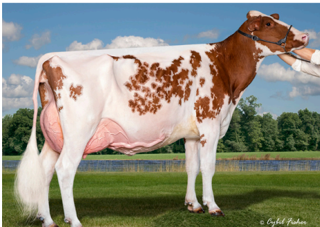
Kress-Hill SHALLOW-Red-ET Nom. Jr. All-American R&W Jr. 3 Year Old 2023