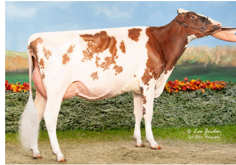
Kress-Hill SHY-Red-ET Nom. Jr. All-American R&W Summer Jr. 2 Old 2024