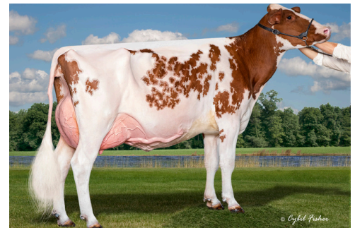
Kress-Hill SHALLOW-Red-ET Dam of Lots 10-13

3142582610 EX-92 GPTA +2.97T +1.89UDC +1.77FLC 89R 12/25 2-05 2x 305d 28,301 4.1 1167 2.9 821"