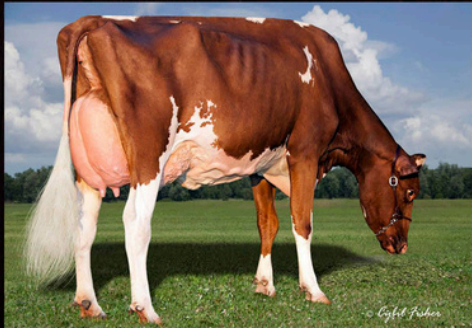
SIEMERS DESTRY SUNNY EX-93 - GDAM