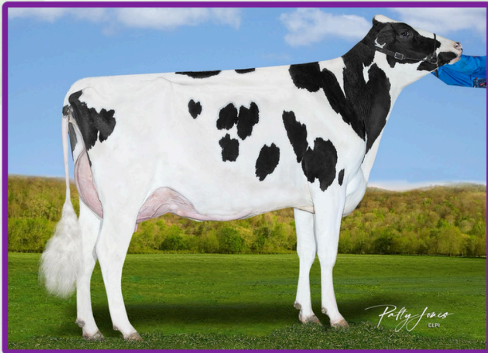
Kingsway Juicy Fruit VG-86-2YR Dam of Embryos