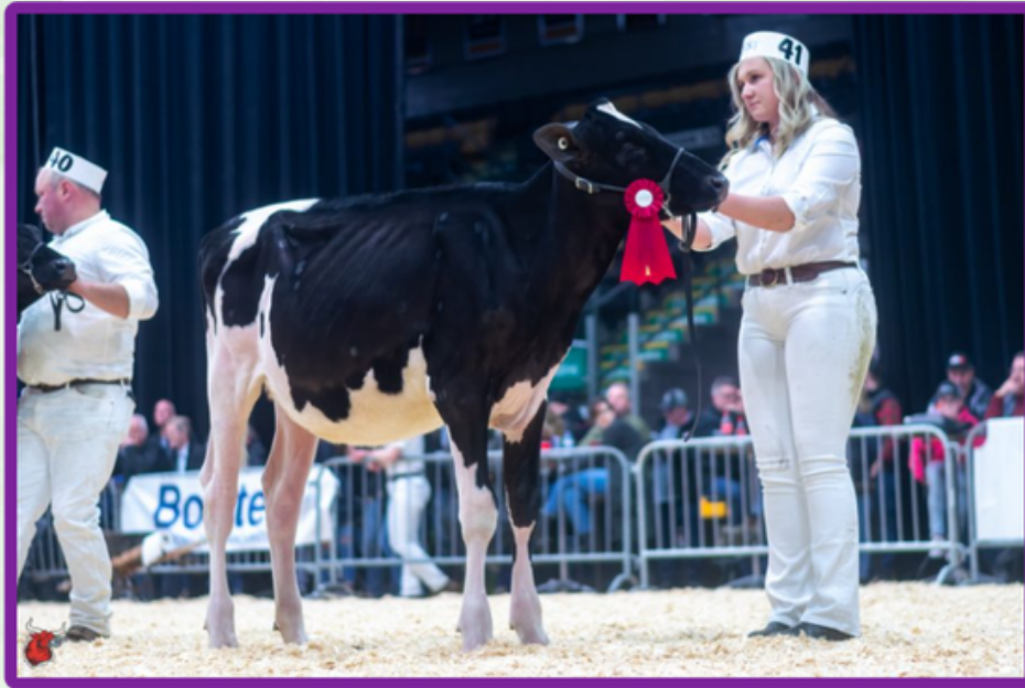
3Ridge Warrior Madison 1 st Fall Calf Expo Printemps 2023 Maternal Sister to Embryos