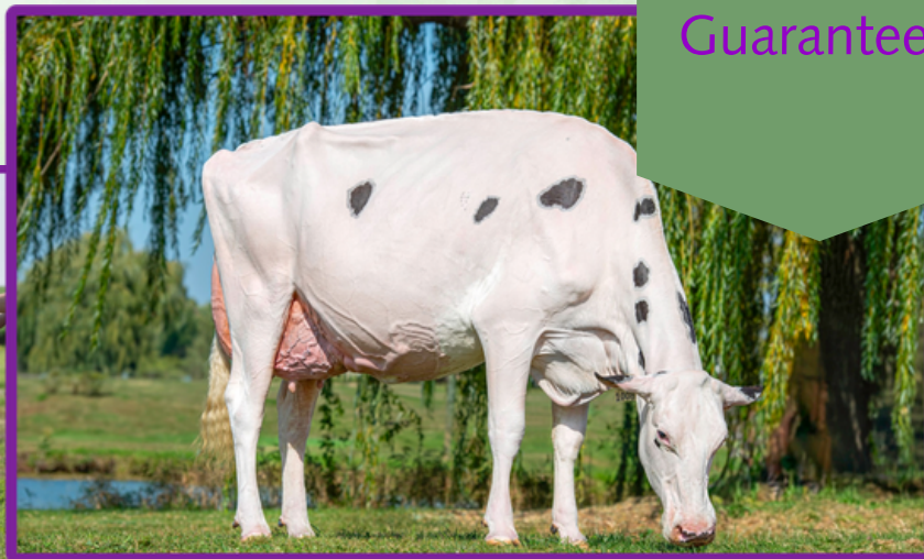
Martiann A2P2 Royal 1008 VG-89-3YR MAX 2 nd Dam of Embryos