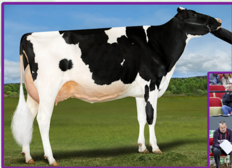
D2 Summerfest Eyes On You EX-90 Dam of Embryos