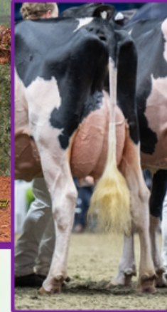
Fricosos Lambda Anakin VG-89-3YR MAX 10th Fall 2 Year Old RAWF 2025 Dam of Embryos