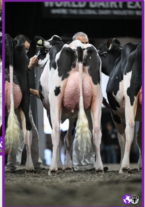
Martin-View Bullseye Crosby VG-87-2YR MAX 3rd Milking Yearling WDE 2025 Dam of Embryos