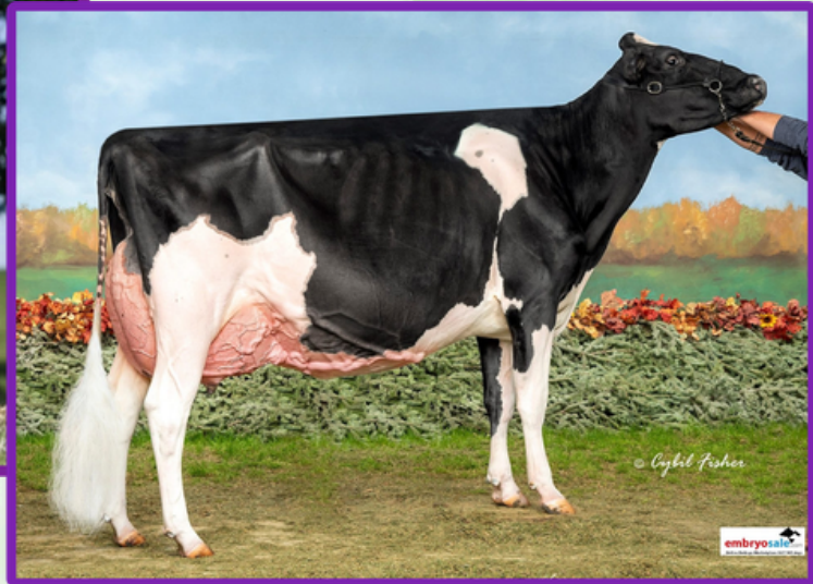
Peace&Plenty Doc Jubie16 EX-96 1 st Lifetime Production WDE 2025 2 nd Dam of Embryos