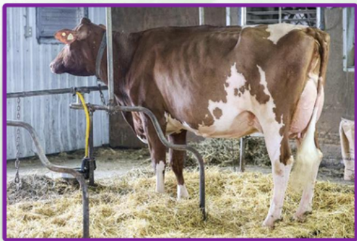
Beauvoir Baba Revere VG-88-3YR