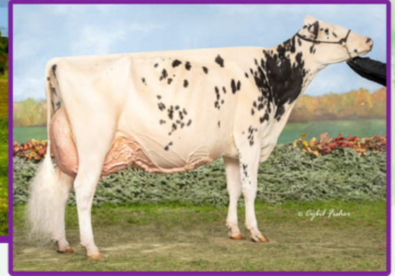
Erbacres Snapple Shakira EX-97-4E 9* Grand Champion WDE 2021, 2023 Grand Champion RAWF 2021, 2023 2 nd Dam of Embryos