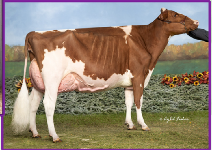
Blondin Unstopabull Maple EX-94-4YR Grand Champion RAWF 2022 Maternal Sister to Dam of Embryos