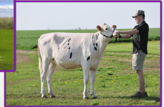
Benbie Logic Rita VG-85-2YR