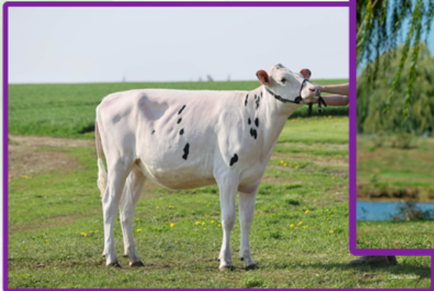
Benbie Logic Rita VG-85-2YR Dam of Embryos