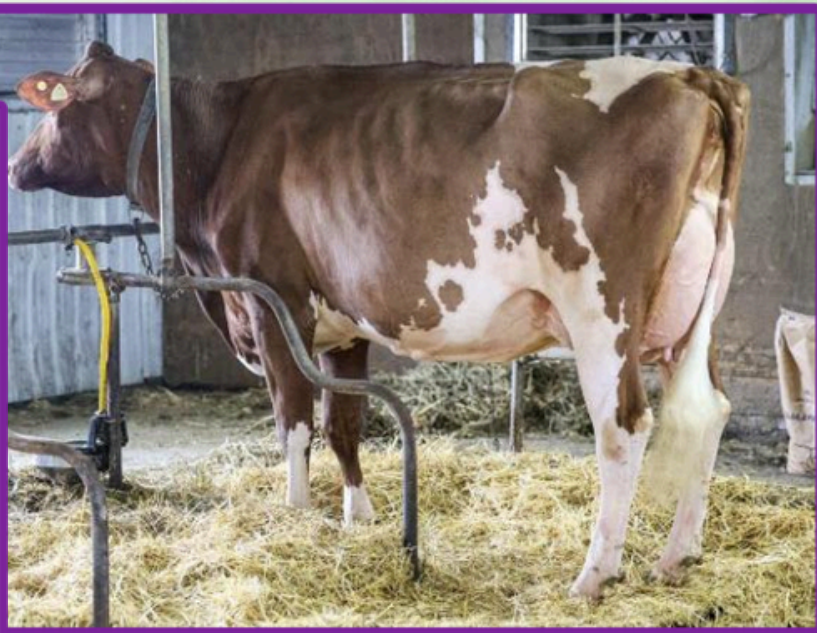
Beauvoir Baba Revere VG-88-3YR Dam of Embryos