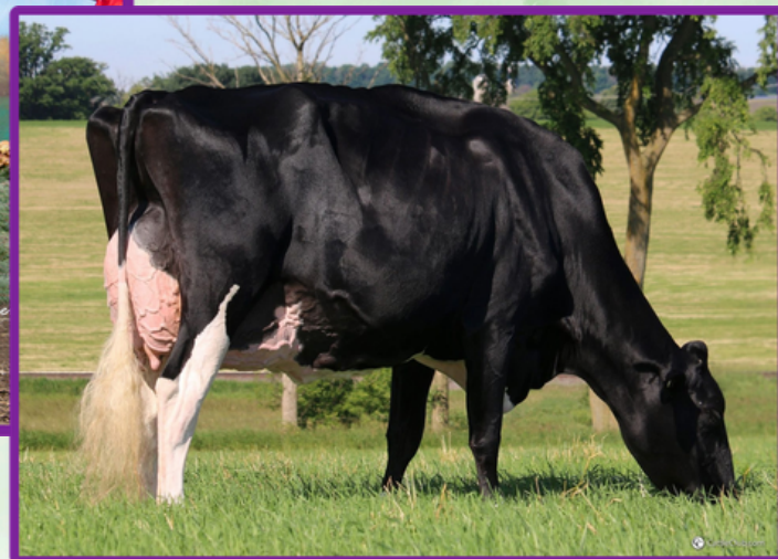
Unique Dempsey Cheers EX-95-5YR 5* Res. Int. Champion WDE 2018 Dam of Embryos