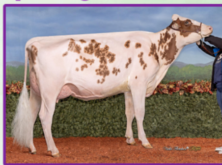
Extramile Altitude Apricot VG-86-2YR