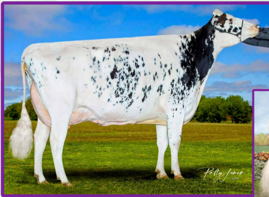
Jacobs Unix Shania EX-90 2* Dam of Embryos