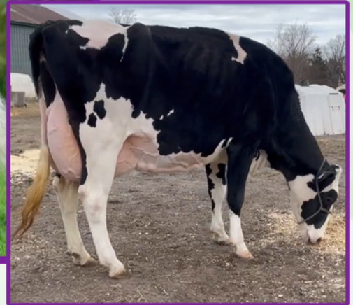
Loyalyn Goldwyn June EX-97-7E 8*