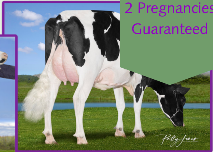
Vouge Bight Serenity VG-85-2YR 2* 2 nd Dam of Embryos