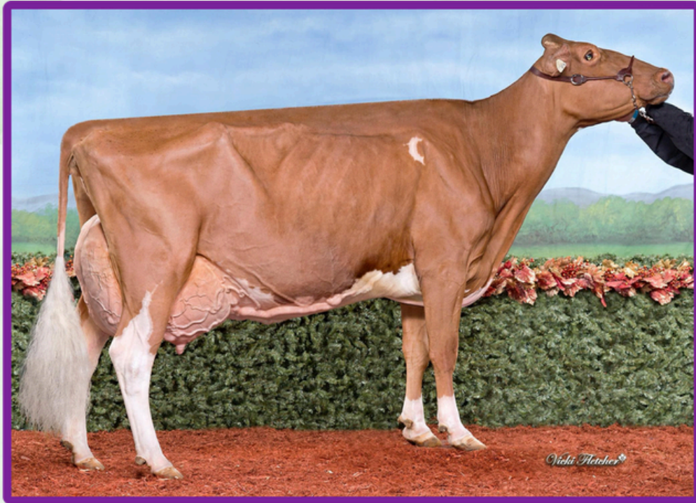
Chanmar Adonis Miss Red EX-94 5E