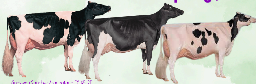
Kingsway Sanchez Arangatang EX-95-2E 3rd Dam of Astro