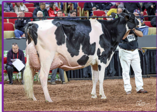
Ladyrose Caught Your Eye EX-95-5YR 2* 3 Time Class Winner WDE 2 nd Dam of Embryos