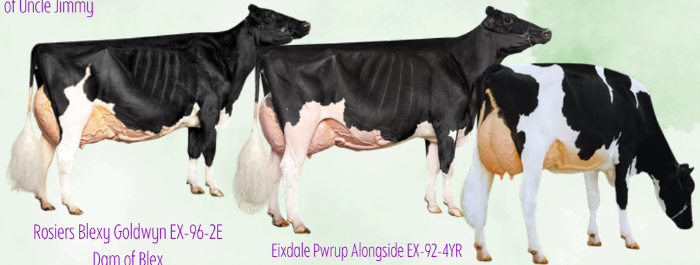
Rosiers Blexy Goldwyn EX-96-2E Dam of Blex