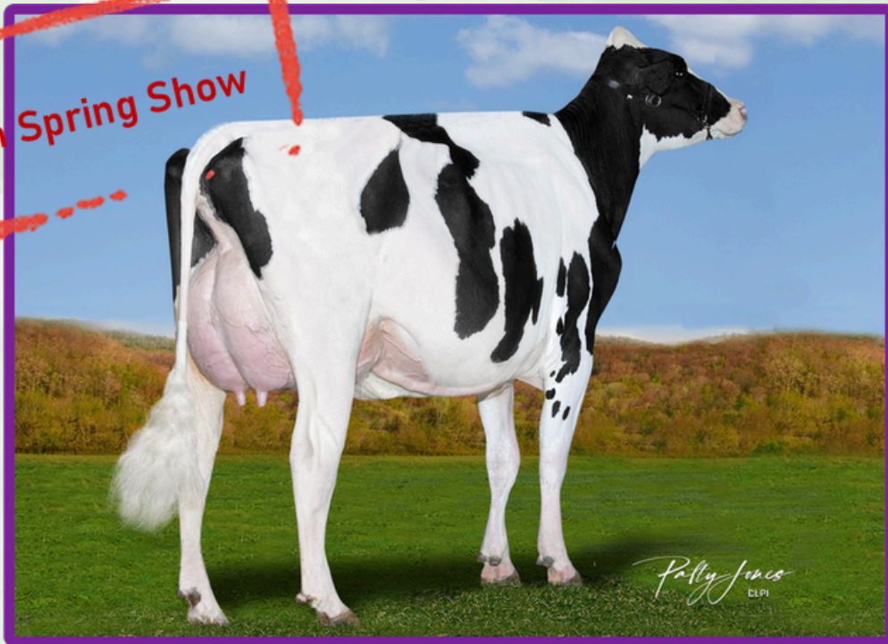
Poplarvale Sidekick Lillian VG-88-3YR Dam of Embryos