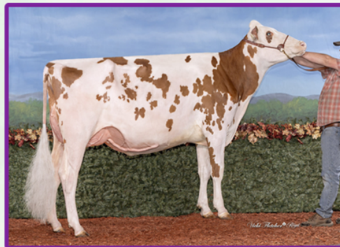
Hodglynn Revere Pomella VG-88-3YR