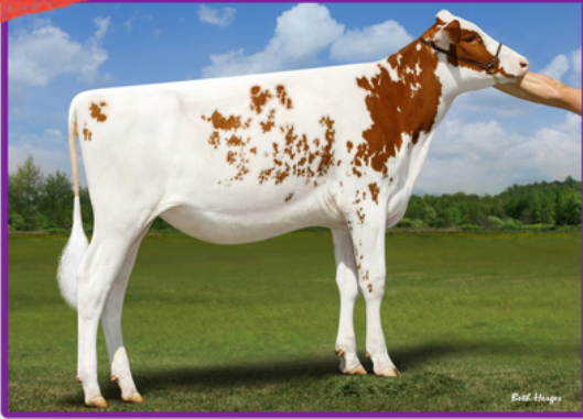
Juniper Lets HavelAll VG-86 2 nd Dam of Embryos