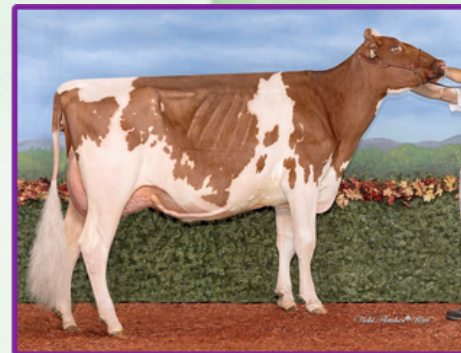
GRO209 Late Nite Snack-P VG-85-2YR