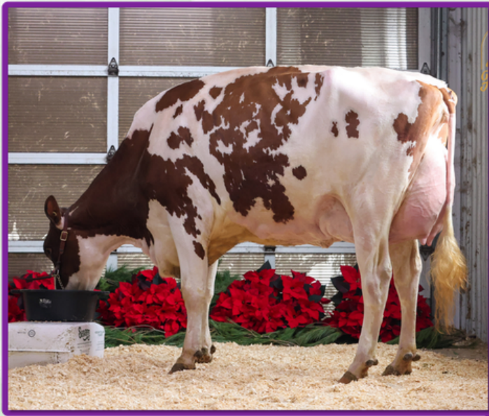
Hodglynn Altitude Mavis EX-90 Dam of Embryos