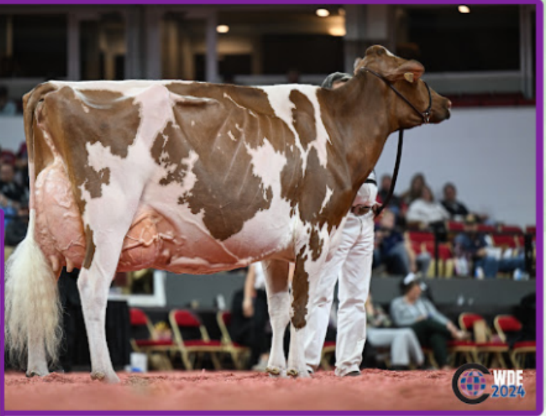
Premium Apple Crisp Lilly EX-95 Grand Champion RAWF 2023, 2024 3 rd Dam of Embryos