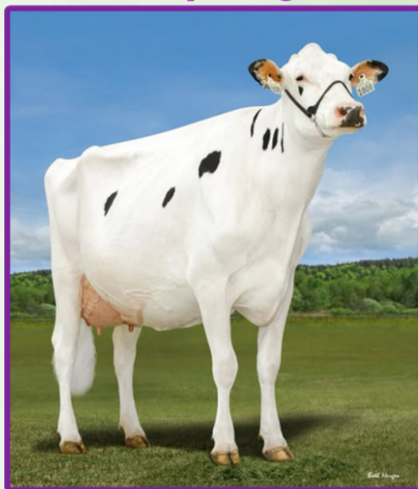
Martiann A2P2 Royal 1008 VG-89-3YR MAX Dam of Embryos