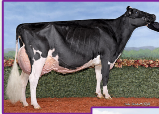
Jacobs High Octane Babe EX-96-2E 6* All-Canadian 5 Year Old 2025 2 nd Dam of Embryos