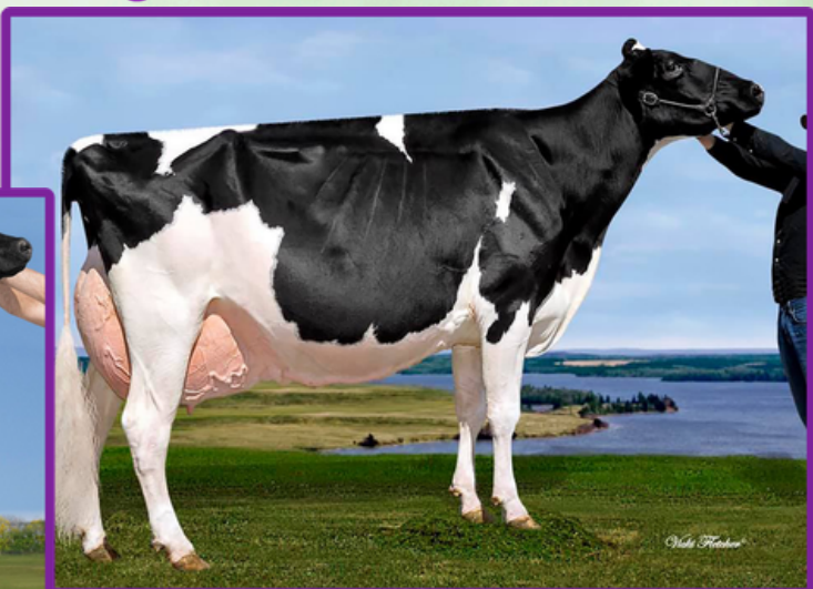
Belfast Doorman Lust EX-90 13* All-Ontario Jr. 2 2016 Dam of Embryos