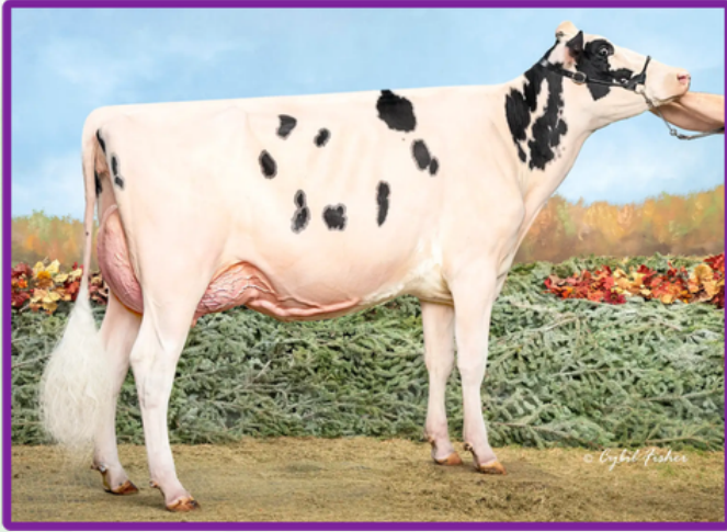
Jacobs Alligator Bawl VG-89-2YR MAX 1 st Milking Yearling WDE 2025 All-American Milking Yearling 2025 Dam of Embryos