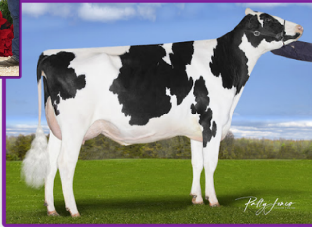
Silvercap Luster Stillness PP VG-86-3YR 1* 1 Superior Lactation