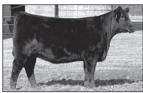
Rains Skylight Love 3EBD – Lot 6